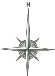
SITE PLAN SCALE 1:1000 @ A3

SHIRE OF IRWIN Planning Approval Granted Subject to the Conditions of Approval No: P24-76 Signed: [Signature] Date: 19/11/24 Sheet: 1 / 3